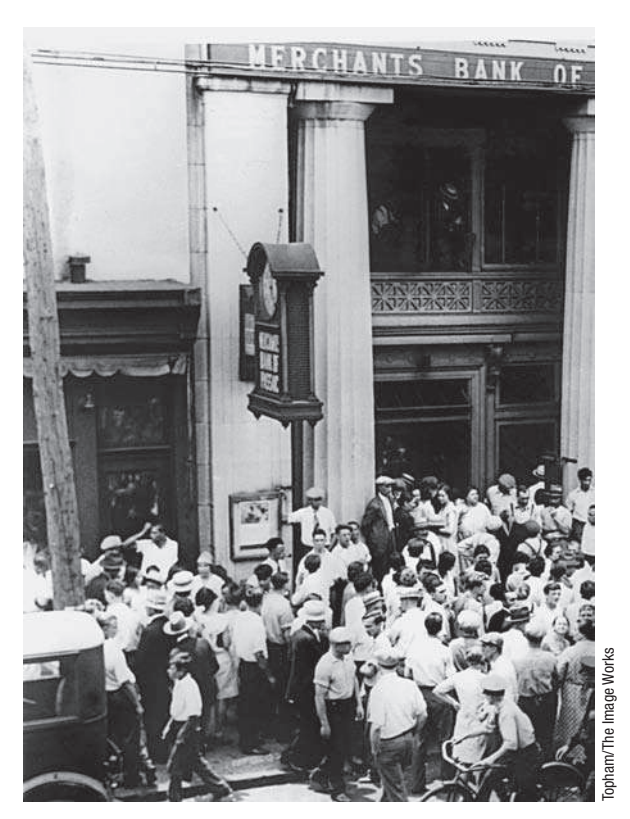
During the Great Depression, depositors besiege a bank hoping to get their savings out.

This situation gives rise to client politics (sometimes called clientele politics); the beneficiary of the policy is the "client" of the government. For example, many farmers benefit substantially from agricultural price supports, but the far more numerous food consumers have no idea what these price supports cost them in taxes and