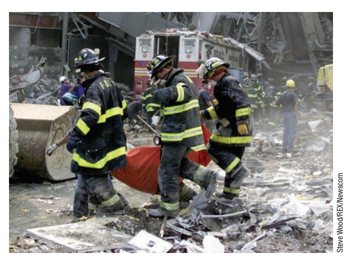
Seeing first responders in action in the immediate aftermath of 9/11, Americans felt powerfully connected to their fellow citizens.

for the government in promoting mine safety. A series of airplane hijackings leads to a change in public opinion so great that what once would have been unthinkable requiring all passengers at airports to be searched before boarding their flights—becomes routine.