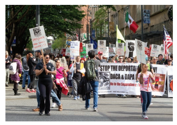
Immigration reform advocates organize a rally to build popular support for their cause.

For any representative democracy to work, there must, of course, be an opportunity for genuine leadership competition. This requires in turn that individuals and parties be able to run for office; that communications