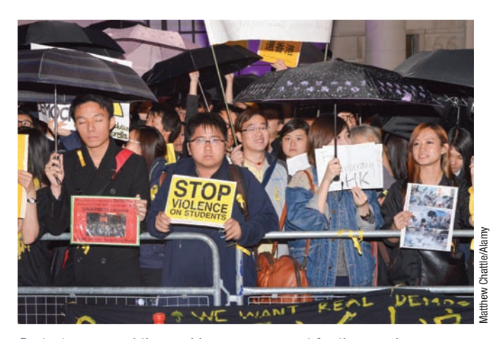
Protestors around the world express support for the pro-democracy movement in Hong Kong.

Democracy is a word with at least two different meanings. First, the term democracy is used to describe those regimes that come as close as possible to Aristotle's definition—the "rule of the many." 10 A government is democratic if all, or most, of its citizens participate directly in either holding office or making policy. This often is called direct or participatory democracy. In Aristotle's time-Greece in the 4th century B.C.—such a government was possible. The Greek city-state, or polis, was quite small, and within it citizenship was extended to all free adult male property holders. (Slaves, women, minors, and those without property were excluded from participation in government.) In more recent times, the New England town meeting approximates the Aristotelian ideal. In such a meeting, the adult citizens of a community gather once or twice a year to vote directly on all major issues and expenditures of the town. As towns have become larger and issues more complicated, many town governments have abandoned the pure town meeting in favor of either the representative town meeting (in which a large number of elected representatives, perhaps 200-300, meet to vote on town affairs) or representative government (in which a small number of elected city councilors make decisions).