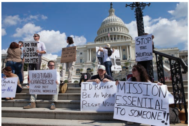
Federal employees protest the 2013 government shutdown.

Understanding preferences is vital to understanding power. Who did what in government is not hard to find out, but who wielded power-that is, who made a difference in the outcome and for what reason-is much harder to discover. Power is a word that conjures up images of deals, bribes, power plays, and arm-twisting. In fact, most power exists because of shared understanding, common friendships, communal or organizational loyalties, and different degrees of prestige. These are hard to identify and almost impossible to quantify.