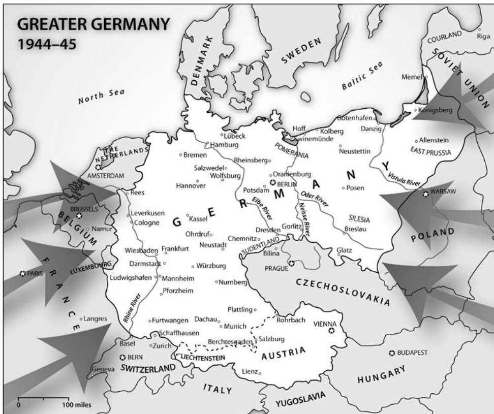
MAP BY JOAN PENNINGTON