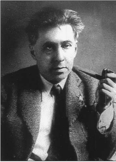
(left) Ilya Ehrenburg

UNLESS OTHERWISE NOTED, PHOTOS ARE IN THE PUBLIC DOMAIN