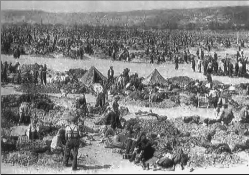
(above) American Death Camp