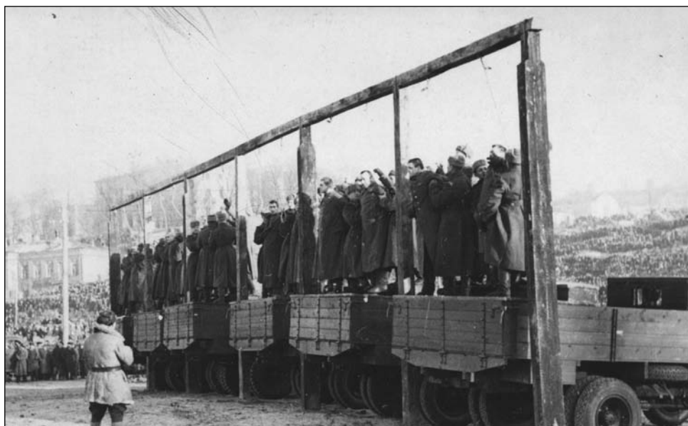
Public execution of Germans on Kreschatik. Kiev, 1946.