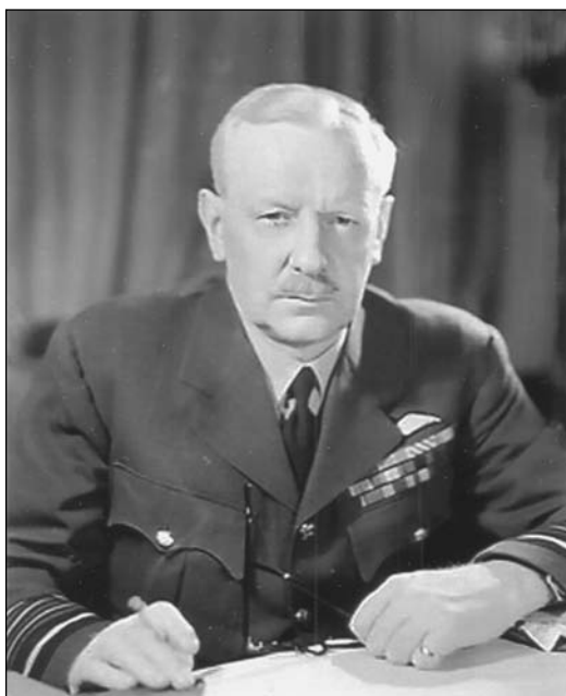
(left) Arthur Harris