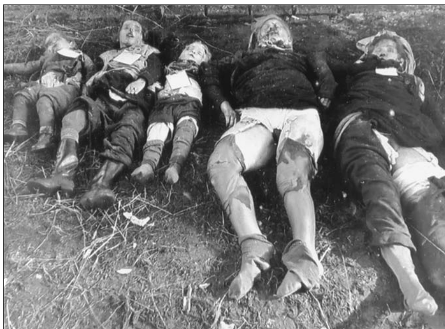
The "Good War"