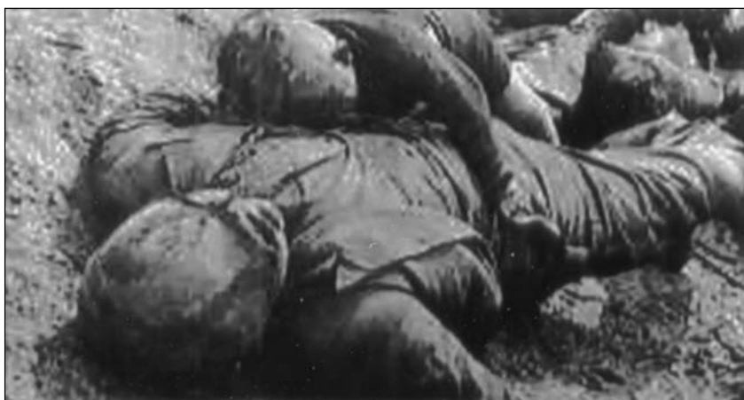
(above) After the Fire Storm