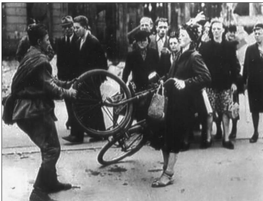
(above) The Spoils of War