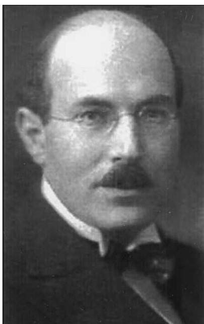
(left) Victor Gollancz