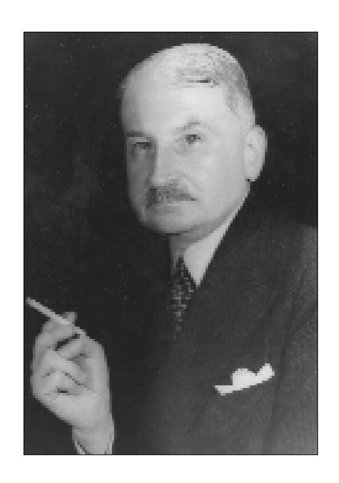
LUDWIG VON MISES