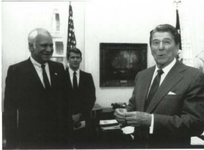
The Oval Office, April 4, 1985. From left: CIA agent Adolfo Calero, political boss of the FDN; Lt. Col. Oliver North and President Ronald Reagan, after the CIA handed off the day-to-day management of the Contra project to North and the National Security Council.