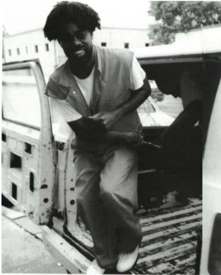
L.A. crack kingpin "Freeway" Ricky Ross was all smiles as he was released from a Texas prison in 1994 after serving a short stint for cocaine trafficking. Though he had vowed to go straight, a few months later he would be lured back into the drug business by his old friend and cocaine supplier, Danilo Blandón.