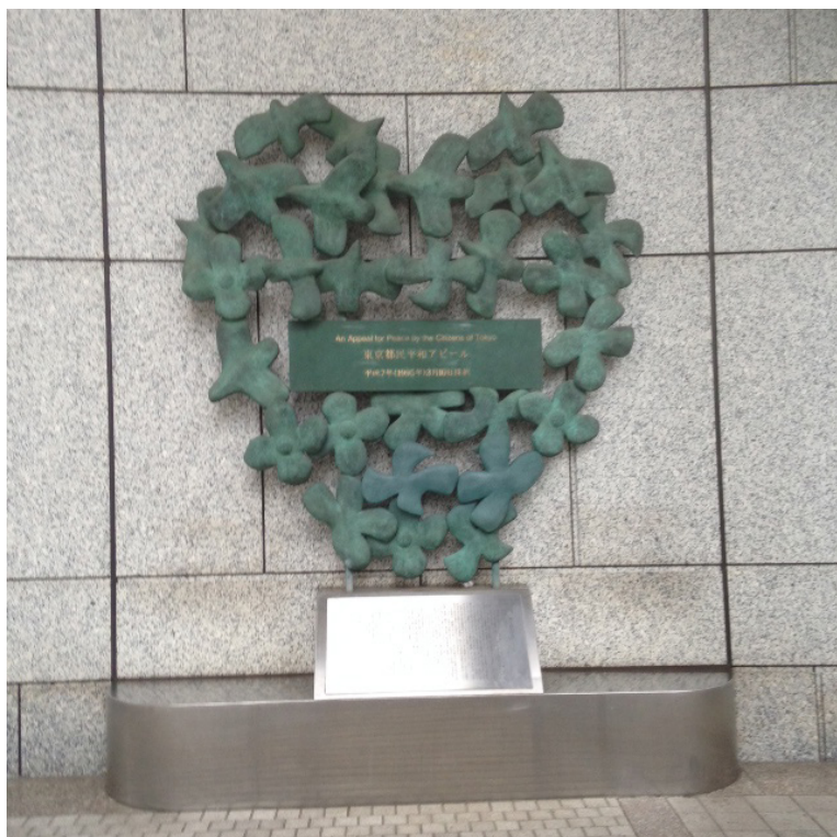
Figure 12: Anti-war sculpture in the plaza of the Tokyo Metropolitan Government Building, designed by Kenzo Tange. The inscription reads 'An appeal for peace by the citizens of Tokyo'.

In common with Bert Hardy in London, he was not going to let his fear get the better of him. The social historian Arthur Marwick