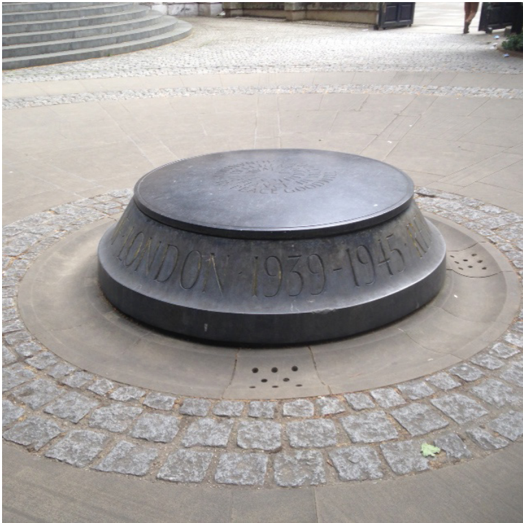
Figure 4: Memorial to the people of wartime London at St Paul's Cathedral.

counters that the survival of the cathedral means something, despite the desolation all around it: