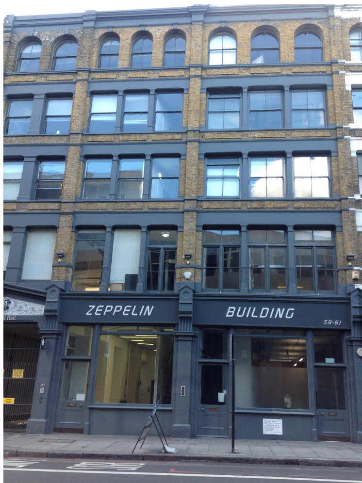
Figure 1: The Zeppelin Building, Farrington, East-Central London (photograph by author, 2017).

further west. London was an obvious objective for the Germans, however. The air raids in the First World War drew an early pattern of incursion and destruction that would be more widely replicated in the Second World War. Among the first areas of London