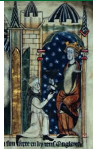
King John is offered a poisoned chalice: Chronicles, c.1280-1300 British Library Cotton MS Vitellius A.xiii, f.5v (detail)

(26) If at the death of a man who holds a lay 'fee' of the Crown, a sheriff or royal official produces royal letters patent of summons for a debt due to the Crown, it shall be lawful for them to seize and list movable goods found in the lay 'fee' of the dead man to the value of