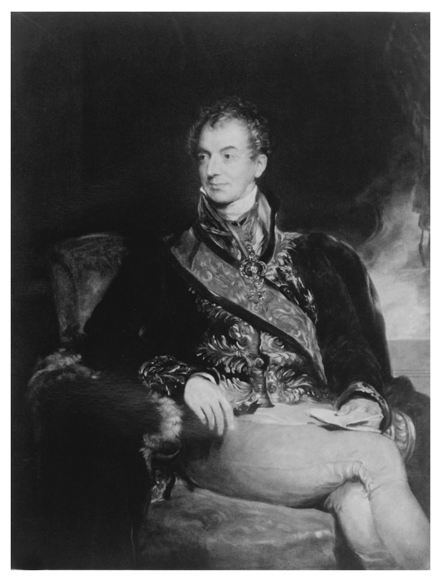
Sir Thomas Lawrence, Prince Metternich . This photomechanical print reproduces a portrait by the British painter of Klemens Wenzel, Prince von Metternich, the leading figure of the reactionary Holy Alliance during the period 1815–1848.