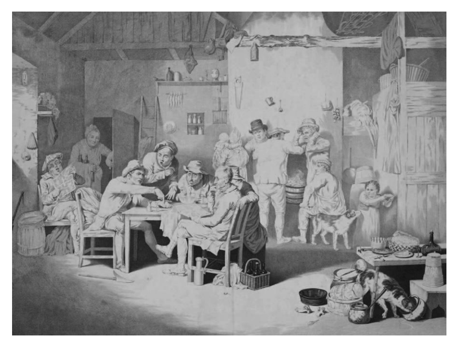
David Wilkie/Abraham Raimbach, Village Politicians . This painting by the Scottish genre painter David Wilkie was the hit of the Royal Academy exhibit in 1806 in London and made his reputation. Wilkie later entered into collaboration with Raimbach to make engravings of his paintings to ensure wide distribution. The first such engraving was this one, done in 1813. The importance of the work was its illustration of how political debate had become a local activity of the populace and was no longer confined to the upper strata.