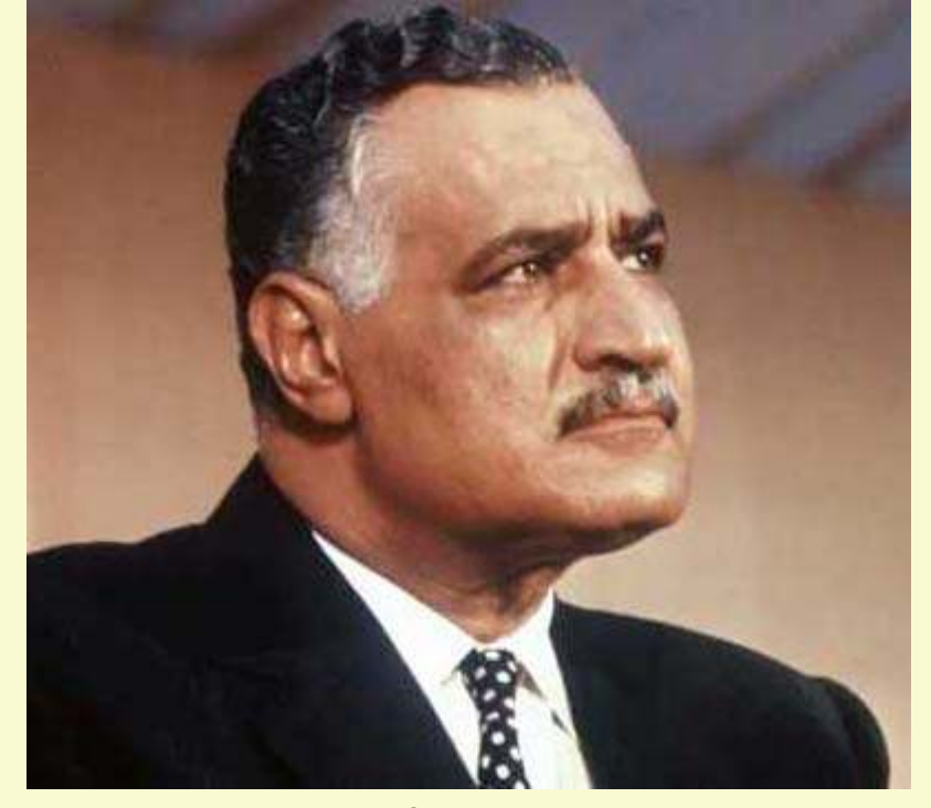
Nasser of Egypt

Livia Rokach - Israel's sacred terrorism