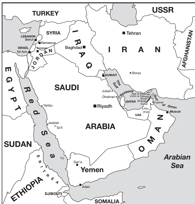
Map A – Middle East and Gulf