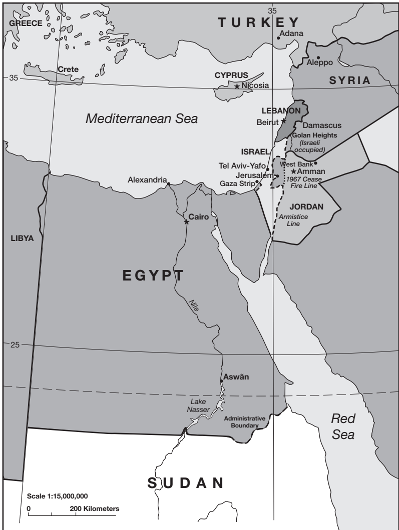
Map B – Israel and neighbouring states

which came first, the Arab–Israeli dispute or the Palestinian–Israeli? Such conundrums rarely have a simple answer, which is why we believe it is best to try to make distinctions between the two in order to assist understanding rather than obscure or confuse. It is true, of course, that the Palestinian issue lies at the heart of the wider conflict. We will argue, however, that the importance of the Palestinians as the primary focus has waxed and waned