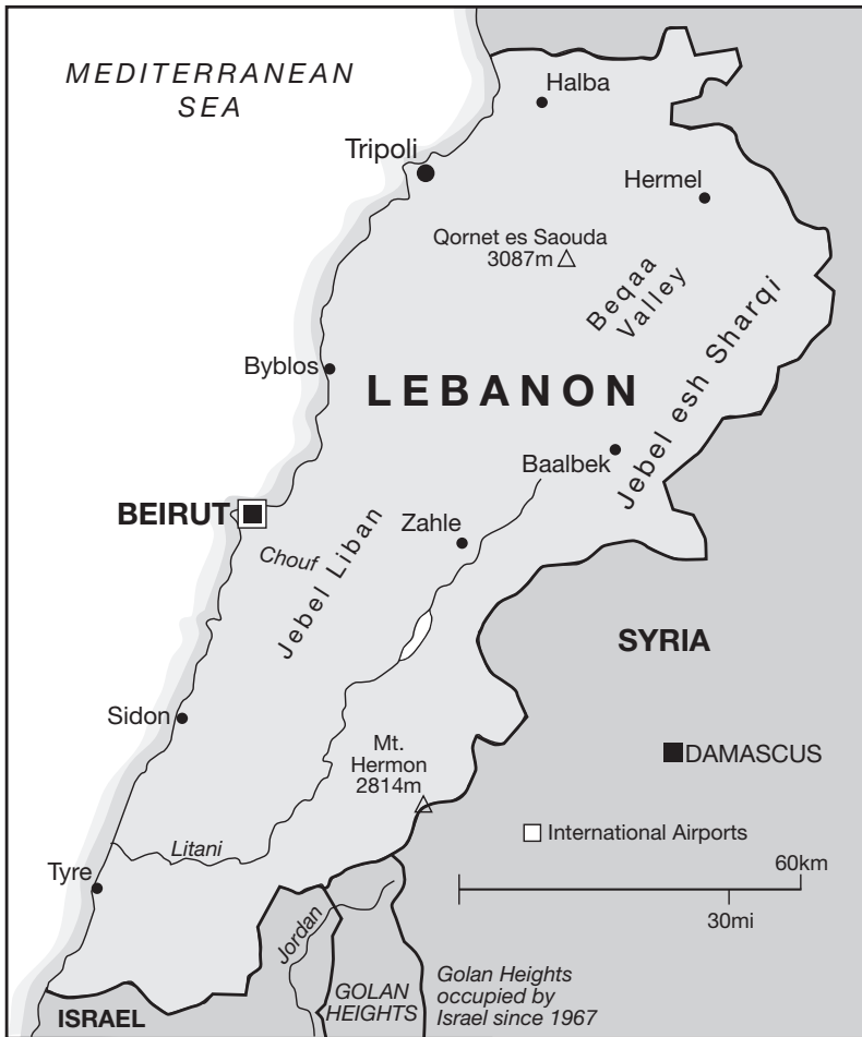
Map C – Lebanon

peace, a comparative neutrality in the conflicts of the region, and a prosperity which seemed to be self-perpetuating'. 1 So what went wrong?