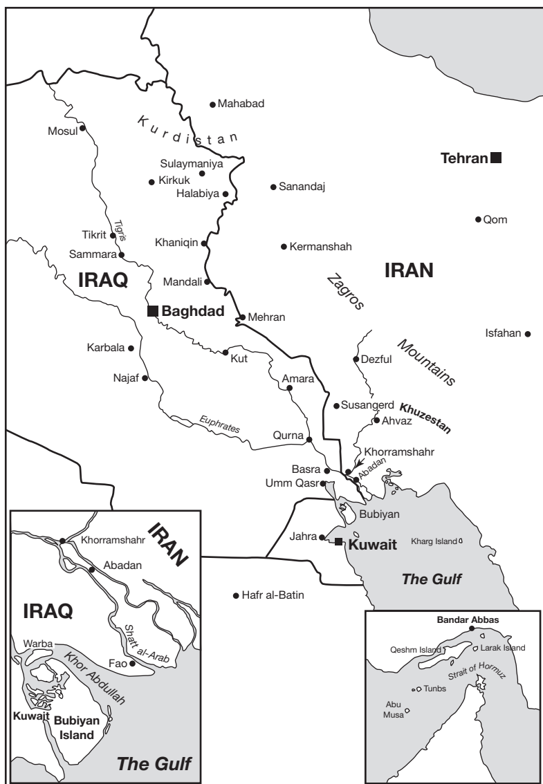
Map E – Iran/Iraq and the Northern Gulf