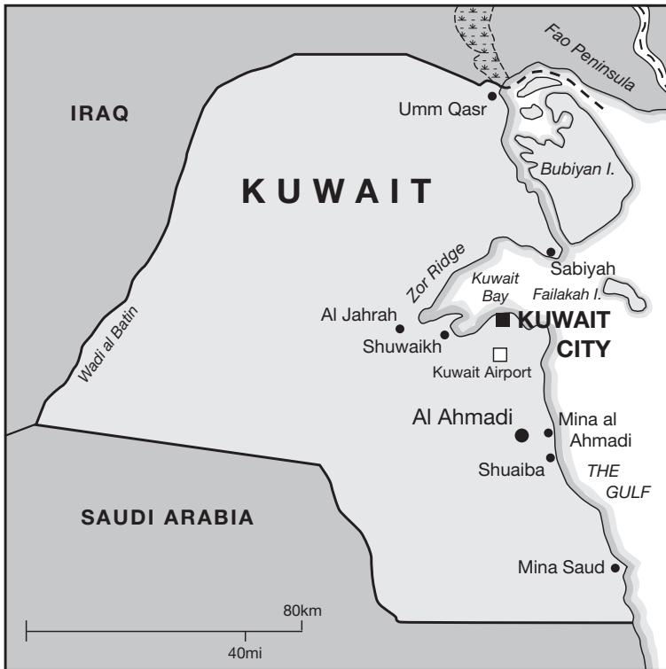
Map F – Kuwait

United States. Following the Soviet disengagement from Afghanistan in 1988, Moscow, although still maintaining great power pretensions, became increasingly reluctant to take on new foreign commitments and was, indeed, unable to honour existing ones. This partial withdrawal from the world stage had serious implications for former traditional clients in the Middle East. Syria, Iraq, South Yemen and the PLO in particular could no longer look to the Soviet Union for economic and military aid, nor, as time went on, for effective diplomatic support.