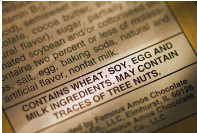
Food products now contain health warnings, such as one for nuts in this package of cookies.

production, regulate the flow of information to citizens, and restrict the scope of personal liberty. Each succeeding crisis left the government bureaucracy somewhat larger than it had been before, but when the crisis ended, the exercise of extraordinary powers ended. Once again, the agenda of political issues became small, and legislators argued about whether it was legitimate for the government to enter some new policy area, such as civil rights or industrial regulation.