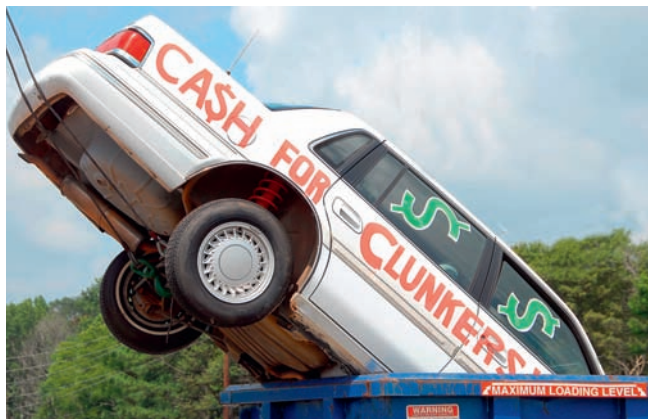
The 2009 stimulus bill allowed people to get money if they traded in an old car that burned a lot of gas.

when they are highly salient and conform to the views of party leaders.