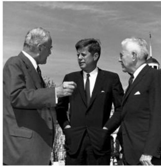
Left: Allen Dulles at his headquarters office in 1954. Right: JFK replaced Dulles with John McCone after the Bay of Pigs.