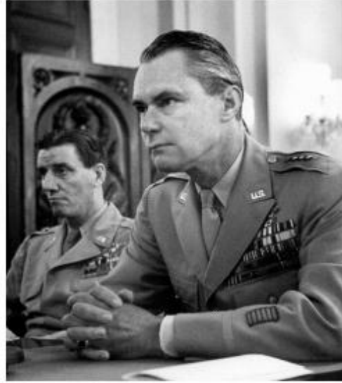
Left: President Truman pins a medal on the first director, Rear Admiral Sidney Souers. Right: General Hoyt Vandenberg, the second director, testifies before Congress.