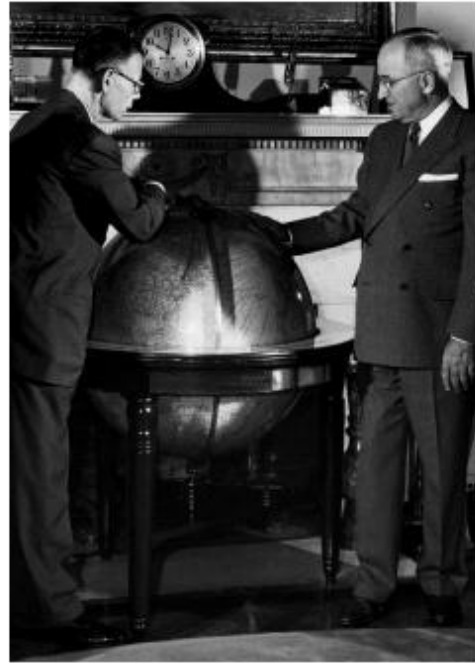
General Walter Bedell Smith, director from 1950 to 1953, was the first real leader of the CIA. Left: With Ike on V-E Day; Right: with Truman in the White House.