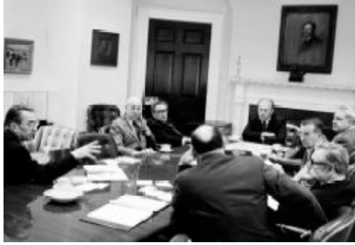
Saigon is falling as director Bill Colby, far left, briefs President Ford in April 1975. Flanking Ford are Secretary of State Henry Kissinger and, far right, Secretary of Defense James Schlesinger.