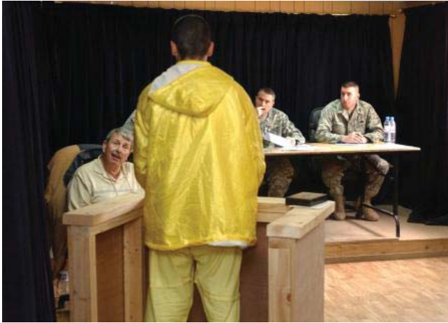
Figure 5.6 A Task Force 134 Board Reviews a Detainee's Case

SOURCE: Defense Video and Imagery Distribution System, 2008a. RAND MG934-5.6