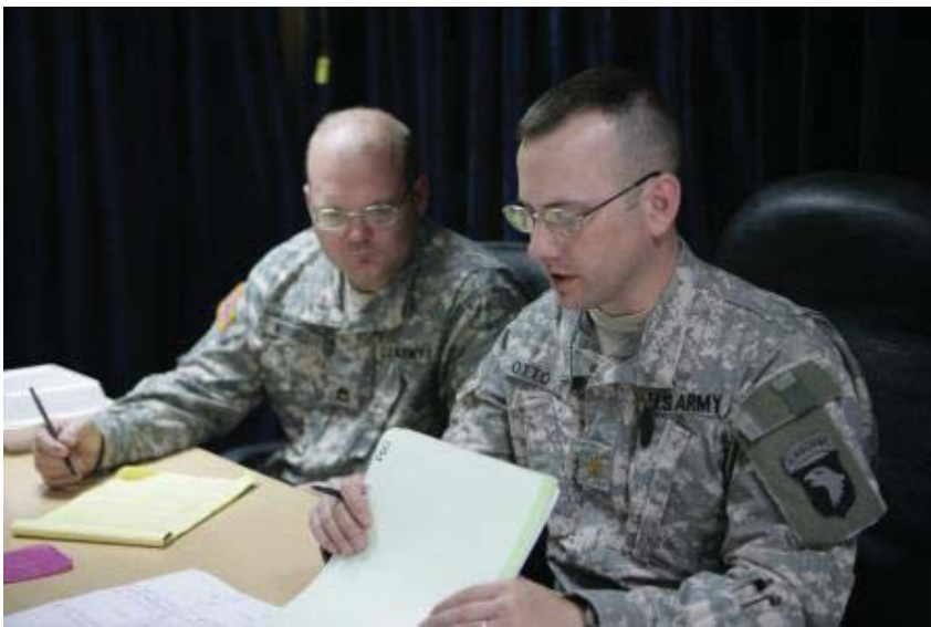
Figure 5.2 U.S. Officials Review a Detainee’s File During a Review Committee Board Meeting