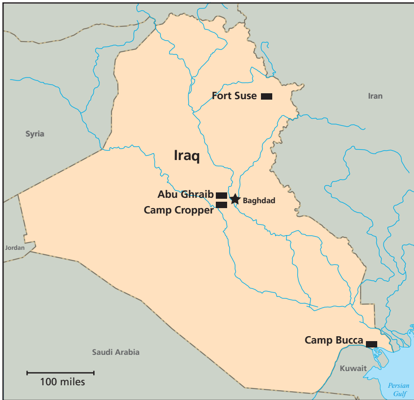
Figure 5.1 Location of Four Theater Internment Facilities in 2005–2006