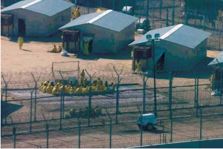
Figure 5.3 Detainees Begin to Educate Other Detainees—Under Task Force Supervision