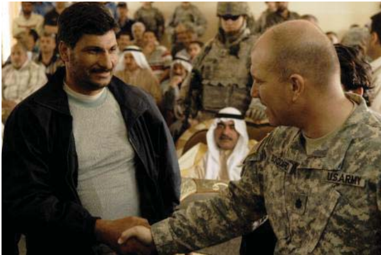
Figure 5.7 A Recently Released Detainee at an Iraqi Police Station