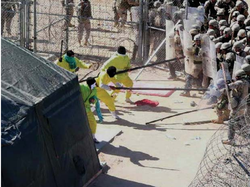
Figure 5.5 Masked Detainees Charge the Guard Force During Riots at Camp Bucca, March 2007