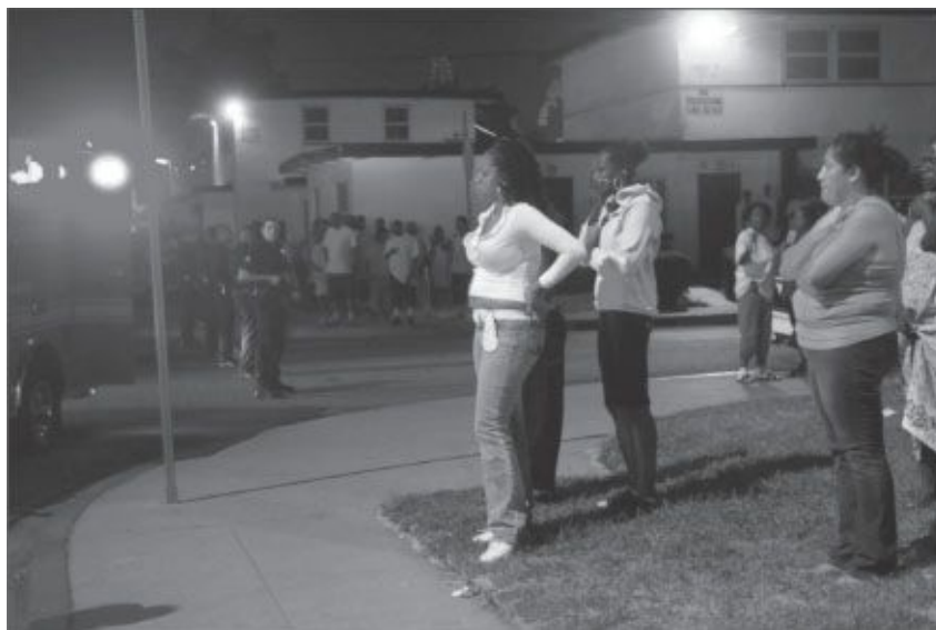
Figure 1. A scene around a gang shooting victim in Los Angeles.

The picture below depicts the scene around a gang shooting victim in Los Angeles.